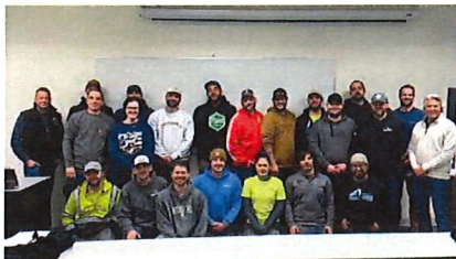
2026 Apprentice Graduates