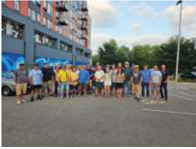
Thanks to those who participated in the Car Show in July.